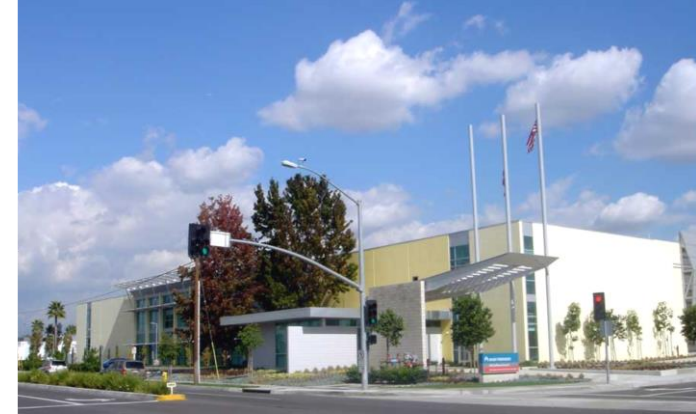
Southern California - Downey

WE ARE PROUD TO BE AN EQUAL OPPORTUNITY/AFFIRMATIVE ACTION EMPLOYER.