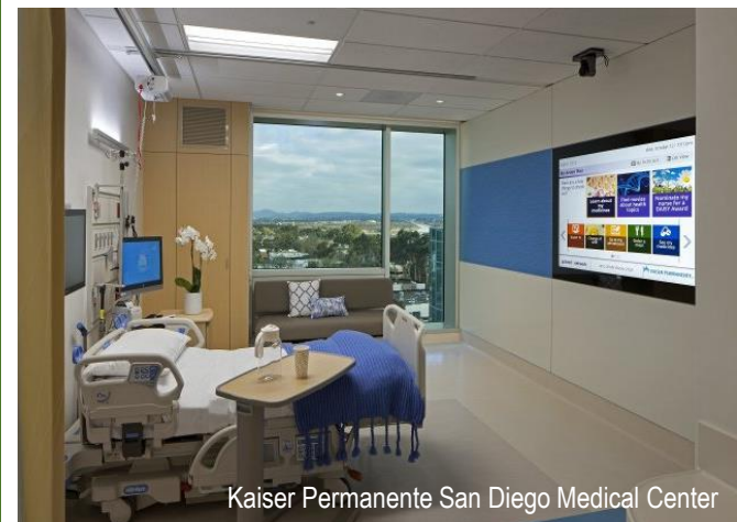
Kaiser Permanente San Diego Medical Center