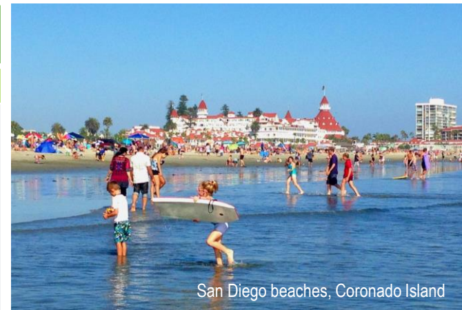
San Diego beaches, Coronado Island