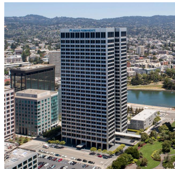
Northern California - Oakland

PGY2 Specialty Residency Medication-Use Safety and Policy - National