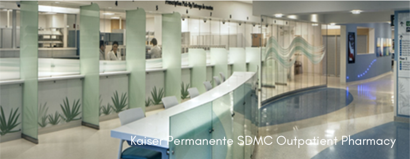
Kaiser Permanente SDMC Outpatient Pharmacy