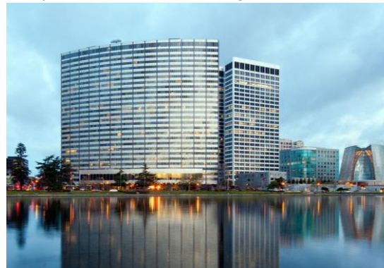
View of KP Northern California Pharmacy Operations Office Building at Lake Merritt